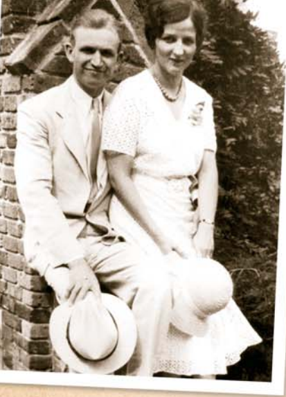
J. Willard and Alice Sheets Marriott, in front of Witchester Apartments shortly after their marriage.

ranges of Nevada and Utah that he never graduated from high school. He was called on a mission at age nineteen, and that provided him the welcome opportunity to leave the farm and spend two years on the East Coast, preaching the gospel from Washington, D.C., to Maine.