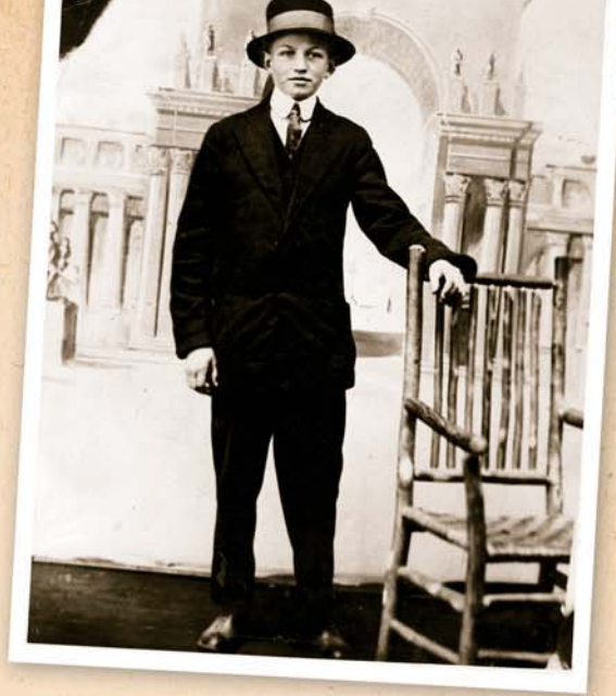
J. Willard Marriott under the Tower of Jewels at the 1915 San Francisco World's Fair.